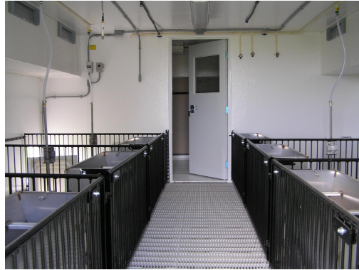
A properly sanitized nursery room