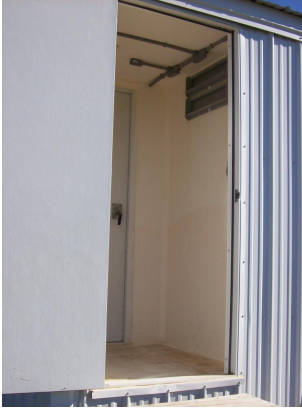
A view of the baffle inlet in the chamber

Note: The double-door system has been extensively tested and found to be highly efficacious at preventing the introduction of virus via contaminated aerosols, both at the SDEC production region model and on filtered commercial farms. It is important to work with an experienced engineer to determine the proper fan size and evacuation period according to the volume of each chamber on the farm.