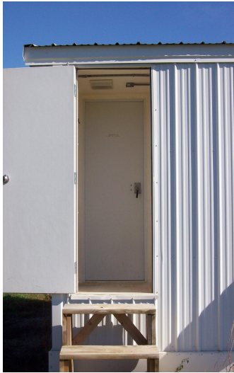
An external view of the double door chamber