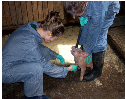
Blood testing isowean gilts in quarantine