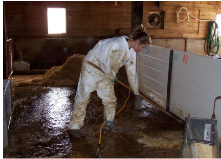
Removal of debris is critical for proper sanitation of facilities