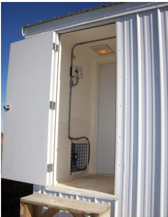
A view of the exhaust fan within the chamber