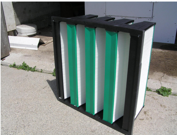
A single MERV 16 filter