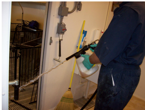
Application of disinfectants via a foamer enhances their effectiveness