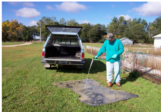
Contaminated transport can serve as a source of PRRSV infection of naïve pigs